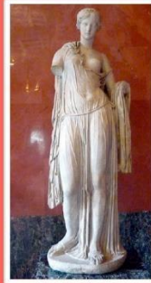
Statue of Venus, a Roman goddess