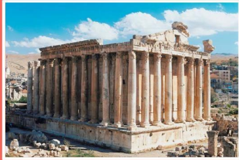
Remains of a Roman temple

The ancient Romans would go to the temple everyday to give offerings of meat and other gifts such as flowers to the gods. In the temples and in different places around the city there were also lots of statues of different gods and goddesses.