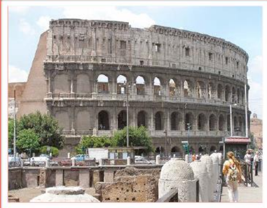
Visit the Colosseum