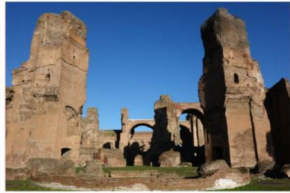
Explore the ruins of the Baths of Caracalla