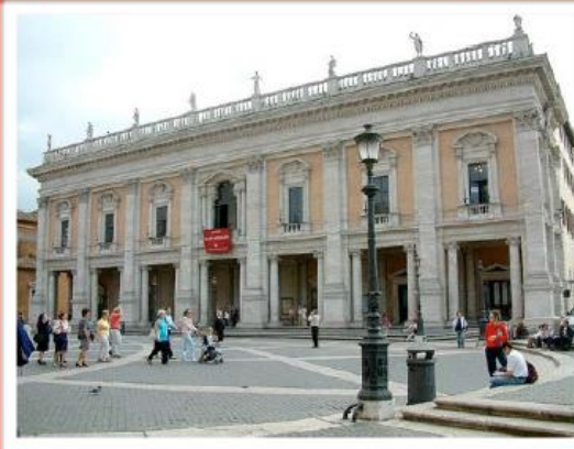
Explore the Capitoline museums