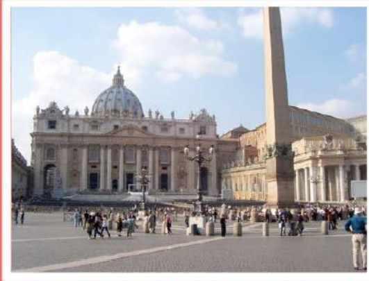
Visit the largest church in the world in St Peter's Square