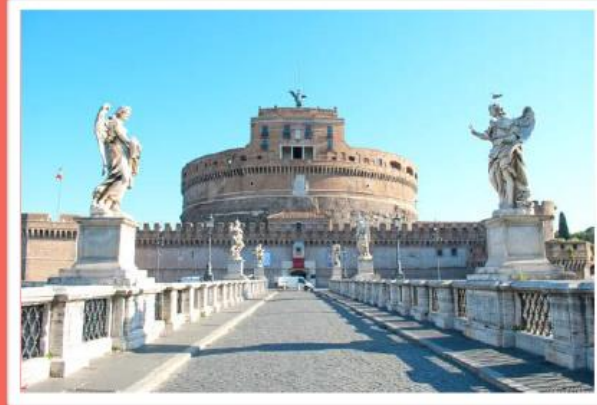
Visit the Castel Sant'Angelo