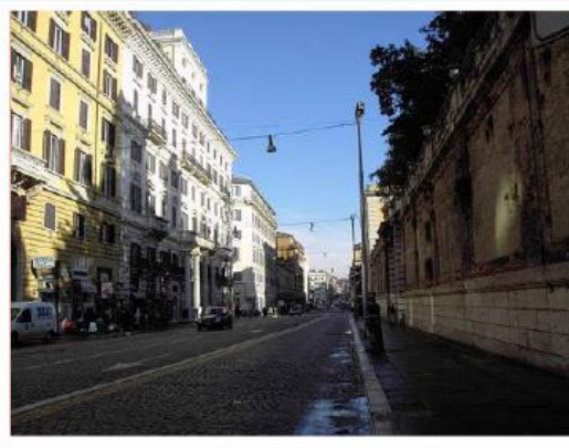
Go shopping along the Via Nazionale