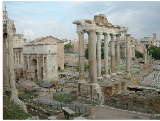
Visit the Roman Forum