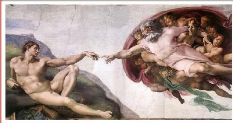
Visit the Sistine Chapel