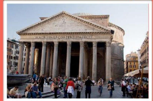
Visit the Pantheon