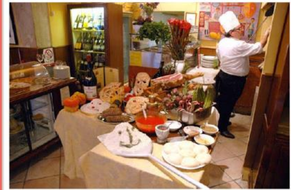
Sample traditional Italian food in a restaurant