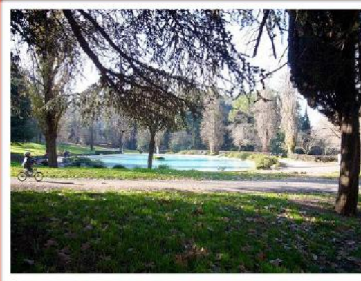
Spend time in Villa Borghese