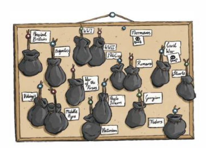
Chapter 4 An Impossible Possibility

Tilda double-checked more than twenty dates, each time finding a corresponding entry in the professor's journal. The entries themselves were incredibly detailed, not only describing the people its owner had allegedly met and a number of significant historic events, but also containing a reference to a specific artefact and its position in the room.