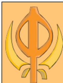
This is the Sikh symbol. It is called the Khanda.

Sikhism is the fifth largest religion in the world and has over 26 million followers across the globe. The largest population of Sikhs can be found in the Punjab area of India where the religion began more than 500 years ago. Sikhs believe in one God, like Christians and Muslims do. They worship at a temple called a gurdwara. The word sikh means disciple or learner in Punjabi.